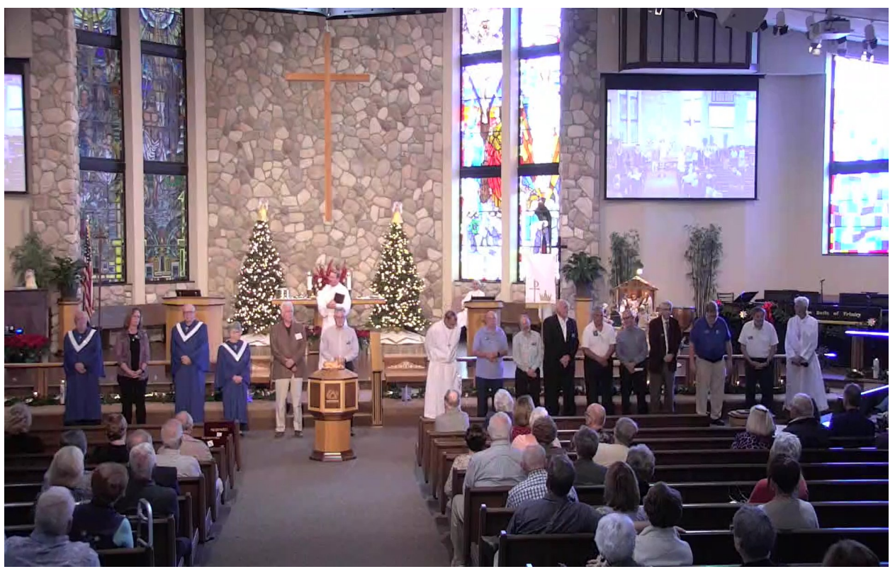
Listed below are the leaders pictured in the above photo beginning from the left:

On January 7, 2024 during our worship service we installed the leaders of Trinity which included the new Board of Directors and the Elders Ministry Team.