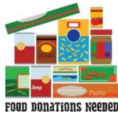
FOOD DONATIONS NEEDED

Community of Gratitude Needs for the week: