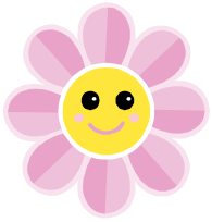
Butch & Vickie Verbeck