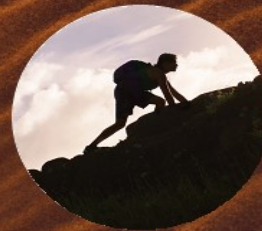
Week 5 GUIDED TO PERSEVERANCE

For the word of the cross is folly to those who are perishing, but to us who are being saved it is the power of God. 1 Corinthians 1:18