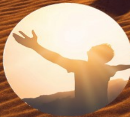
Week 1 GUIDED TO HOPE