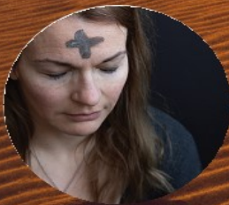
Ash Wednesday GUIDED TO FORGIVENESS