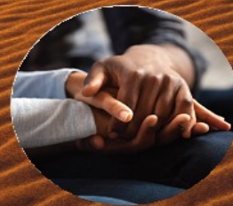
Week 2 GUIDED TO LOVE