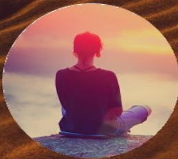
Week 3 GUIDED TO PEACE