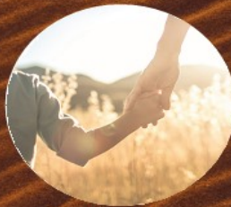
Week 4 GUIDED TO TRUST